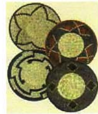
Baskets of Love

We have beautiful African baskets! Each basket is hand crafted by the women of Uganda. They are made of papyrus, wrapped with wheat grass and dyed using natural native plants. Each piece is unique and exquisite. On average they take over one week to create. Let us know or stop by our office if you are interested in making a donation and receiving a basket as a thank-you gift. All proceeds go to support the ministry, specifically the Grandmas program to help cover extra medical expenses and funeral costs.