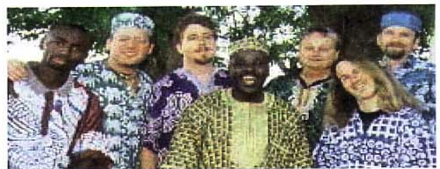
Sifa! Sifa! Africa! Performs at many of our events

We also have many church events scheduled locally throughout the area. Call our office if you are interested in finding out more!