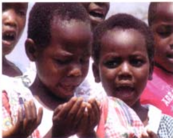
Local school children performing with thanksgiving